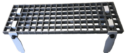
Step with legs extended.