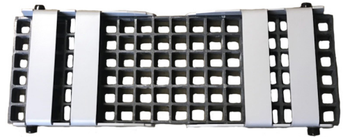
Step with legs in stowed position.

Inspect for rust. If found, treat and coat area with lubricant.